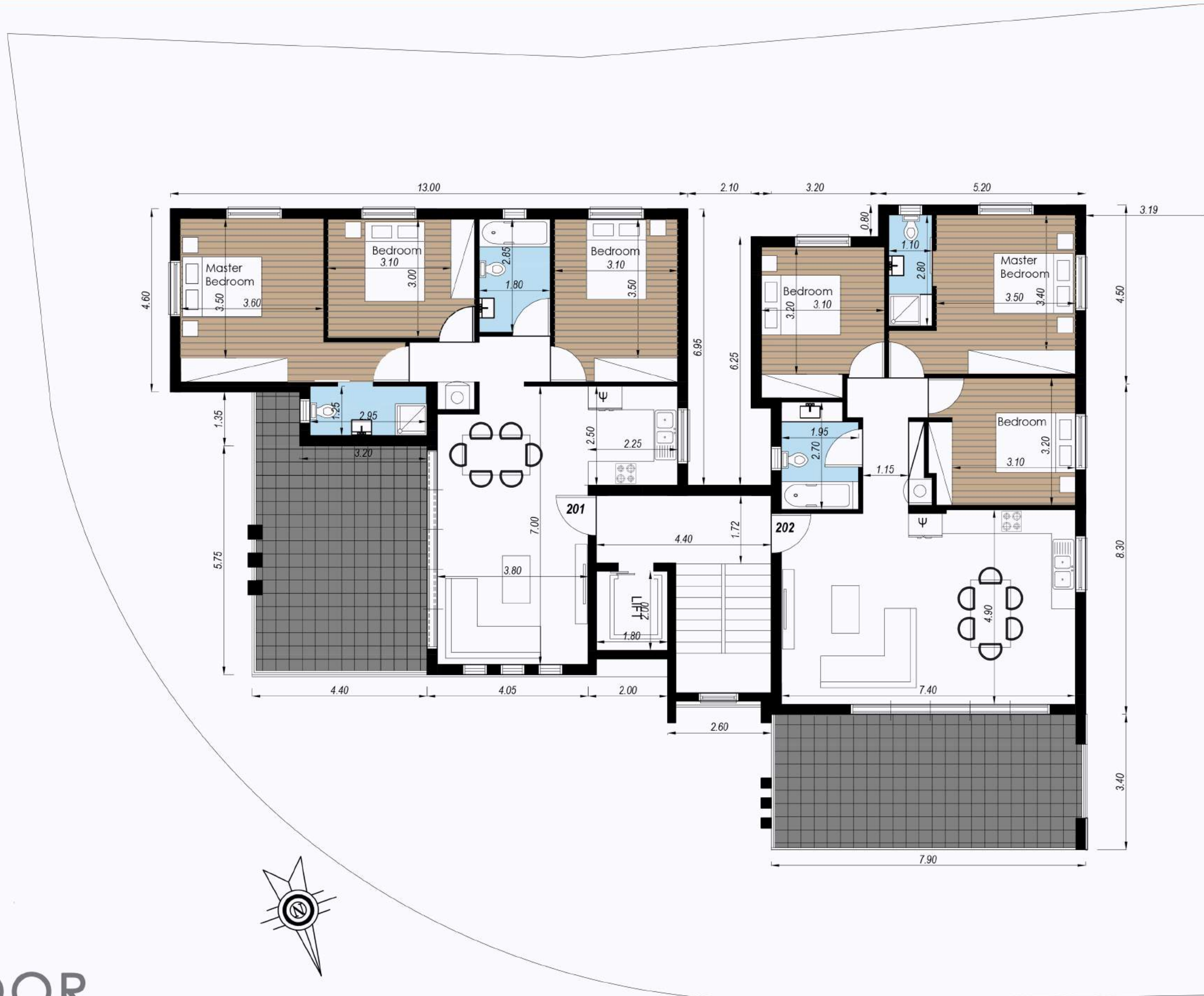
2nd FLOOR Scale 1:100