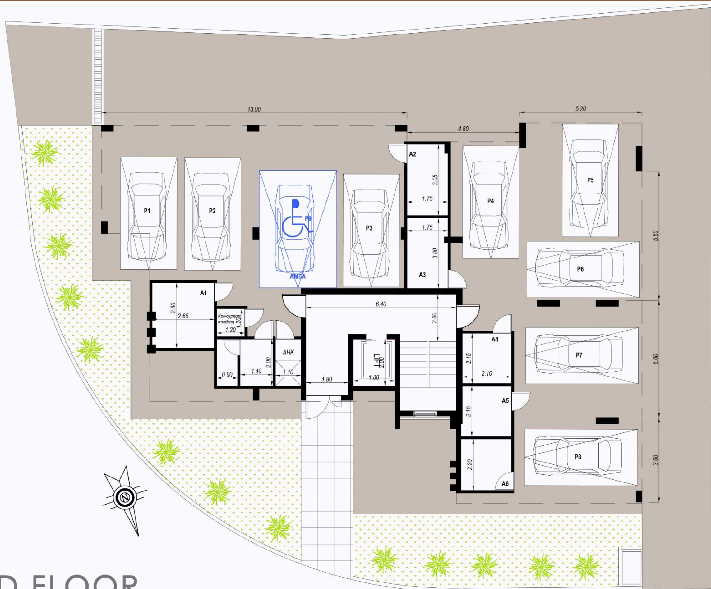
GROUND FLOOR Scale 1:100