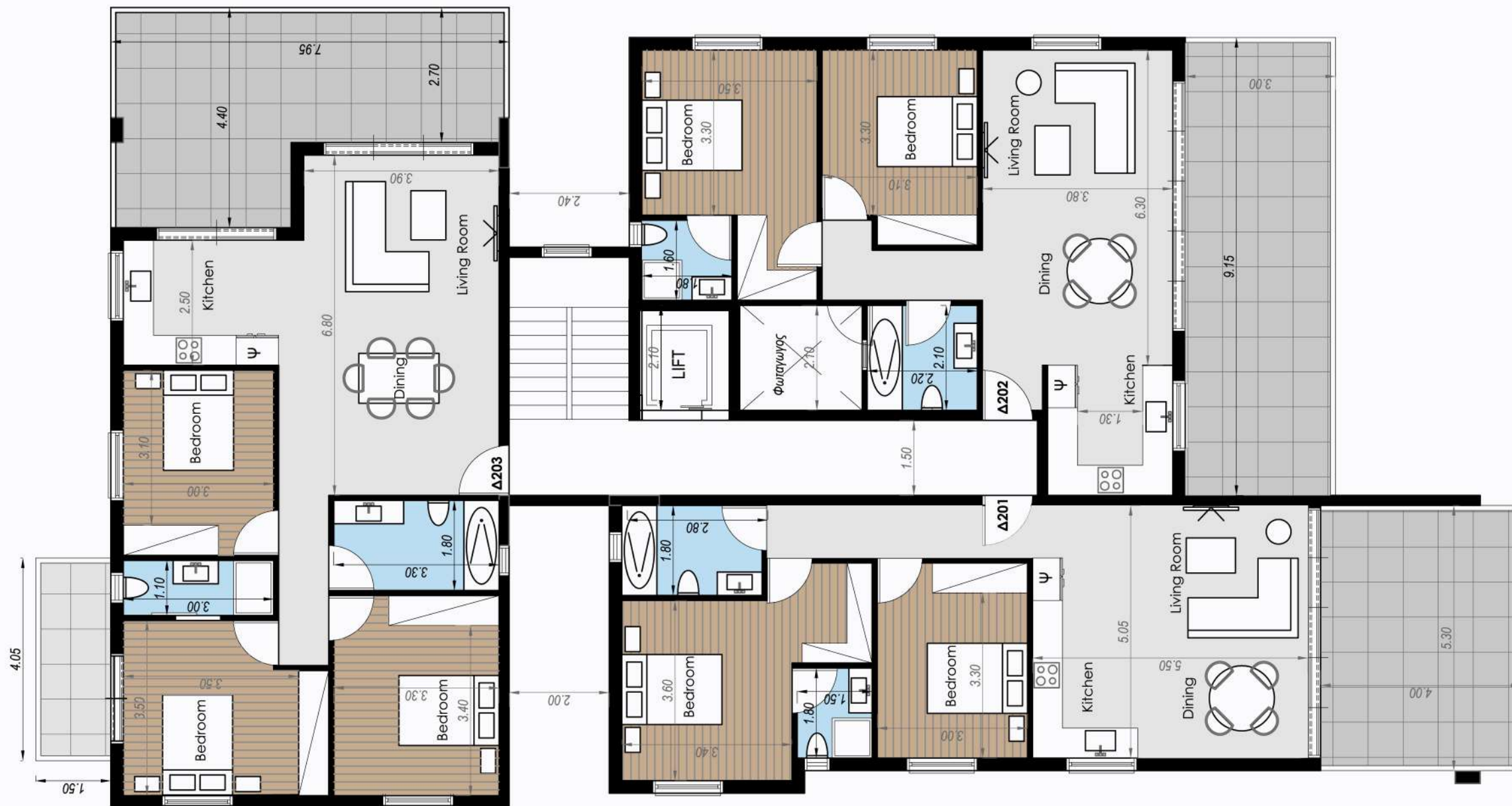
2nd FLOOR Scale 1:100