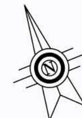
1st FLOOR Scale 1:100